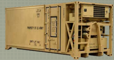
MTRCS01, MTRCS02, and MTRCS03