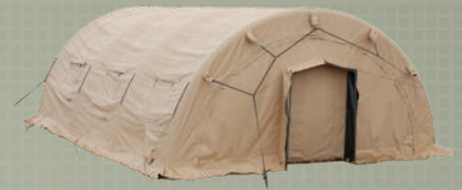
AirBeam® 2021 / 2032 / 2064