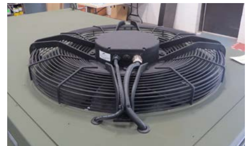
The upgraded quiet fan (available for DRASH 5T and 12T systems) provides a significant reduction in ECU noise.