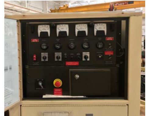
All DRASH 18 kW and 33 kW analog systems (shown above) can be converted to IPT systems, with a digital control panel (below).