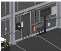
Power Distribution And Sub-Systems Included