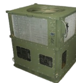
HVAC System Included

HDT Expeditionary Systems, Inc. 30500 Aurora Road, Suite 100 Solon, OH 44139 USA P 800.969.8527 / 216.HDT.6111 sales@hdtglobal.com