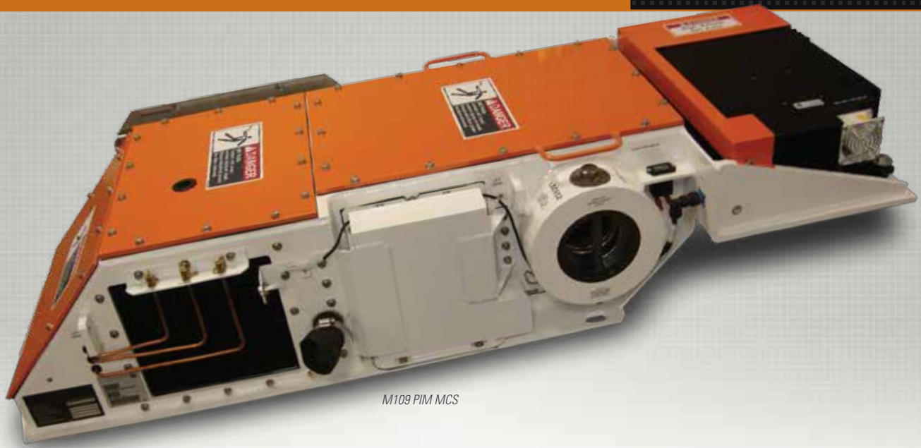
M109 PIM MCS

As a leading developer of specialized heating and air conditioning equipment for military applications, HDT understands the complexities involved in the battle against heat and the associated risks high temperatures present inside combat vehicles. We leverage our years of thermal management experience to develop vehicle environmental control systems that address the heat loads generated by the latest vehicle electronics and provide climate control for operator comfort and safety.