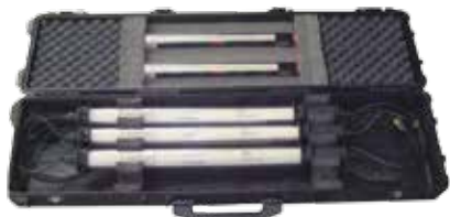
AirBeam Shelter 2021 EMI Hardened Lighting Set