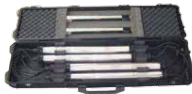
AirBeam Shelter 2032 EMI Hardened Lighting Set