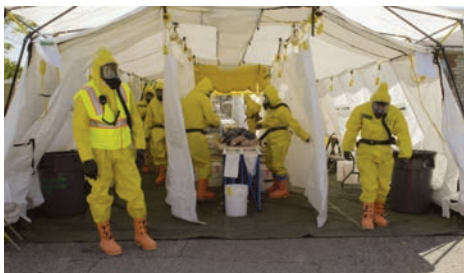
HDT Base-X® Shelters are multi-mission ready. Convert this 305 shelter into a Decon Shelter by inserting a 3-lane Decon Liner.